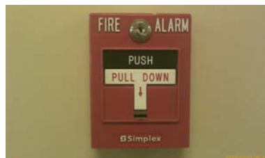
Fire Alarm Station (Three on each floor)