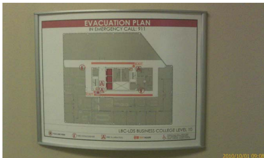
Floor Plan Diagram (One at each floor exit)