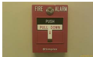
Fire Alarm Station (Three on each floor)