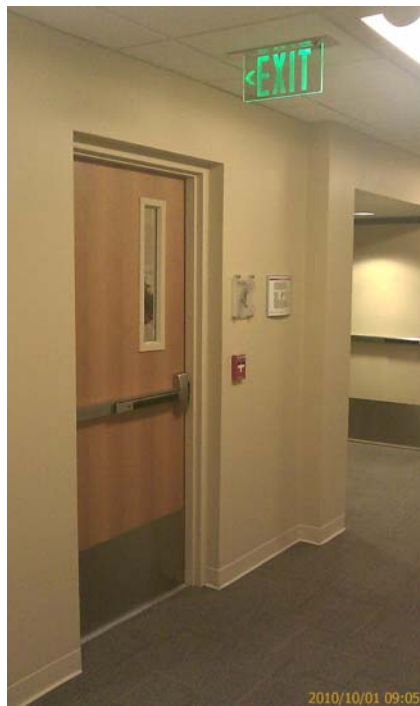
Floor Command Post Location (One on each floor)

Each floor of the LDSBC campus building has a designated floor command post where College Emergency Responders meet to coordinate response efforts when emergency situations arise. The floor command post is located at the door to the west central stairwell exit on each floor. Upon becoming aware of an emergency situation requiring the evacuation of the building, the College Emergency Responders don yellow vests and proceed to the floor command post. The first College Emergency Responder to arrive at the floor command post becomes the floor Emergency Response Leader for the duration of that event. The Emergency Response Leader assigns the other College Emergency Responders as they arrive at the floor command post to search other floor areas and assist the leader in evacuating the floor.