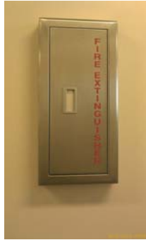
Fire Extinguisher (Two on each floor)