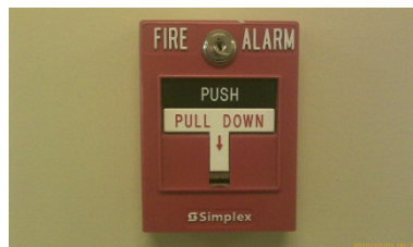
Fire Alarm Station (Three on each floor)