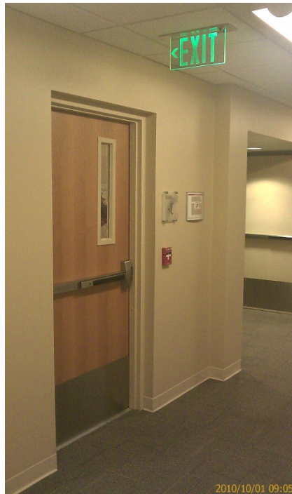
Floor Command Post Location (One on each floor)

Each floor of the LDSBC campus building has a designated floor command post where College Emergency Responders meet to coordinate response efforts when emergency situations arise. The floor command post is located at the door to the west central stairwell exit on each floor. Upon becoming aware of an emergency situation requiring the evacuation of the building, the College Emergency Responders don yellow vests and proceed to the floor command post. The first College Emergency Responder to arrive at the floor command post becomes the floor Emergency Response Leader for the duration of that event. The Emergency Response Leader assigns the other College Emergency Responders as they arrive at the floor command post to search other floor areas and assist the leader in evacuating the floor.