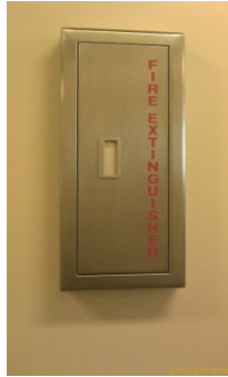
Fire Extinguisher (Two on each floor)