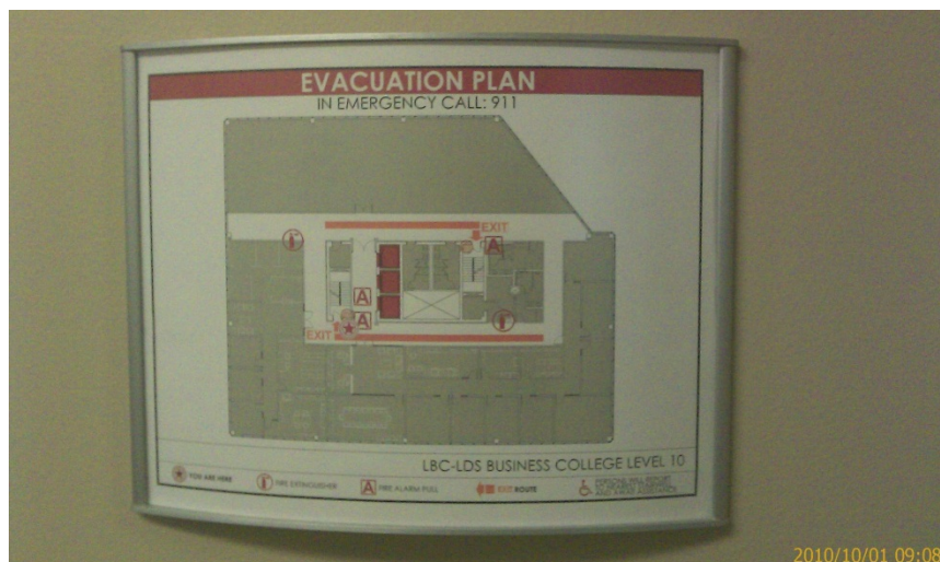
Floor Plan Diagram (One at each floor exit)