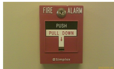
Fire Alarm Station (Three on each floor)